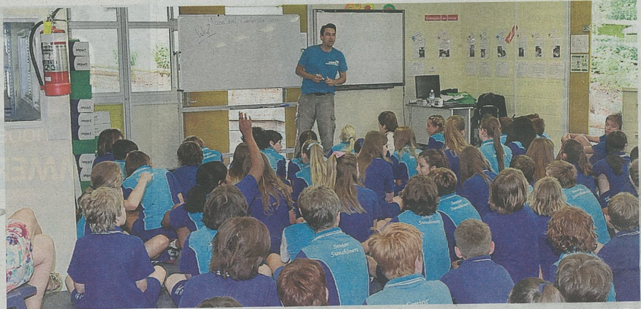
COOL FOR SCHOOL: Sunshine Beach State School Years 5, 6 and 7 students at an anti-graffiti program.